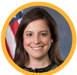
Elise Stefanik UN Ambassador