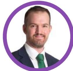
Jameson Greer USTR