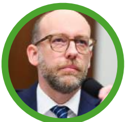
Russ Vought OMB