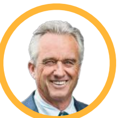
RFK, Jr. HHS