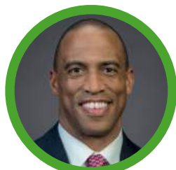
Scott Turner HUD