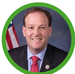
Lee Zeldin EPA

● Committee Hearing Scheduled ● Committee Hearings ● Senate Debate ● Awaiting Full Senate Vote ● Confirmed