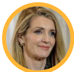
Kelly Loeffler SBA