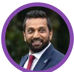
Kash Patel FBI

Click on the link below to see an updated page.