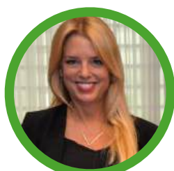
Pam Bondi Attorney General