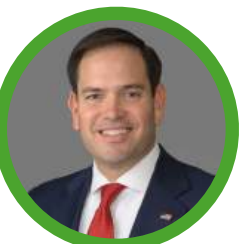
Marco Rubio State