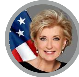
Linda McMahon Education