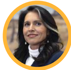
Tulsi Gabbard DNI