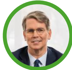
Scott Bessent Treasury