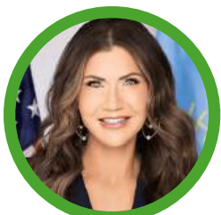
Kristi Noem DHS