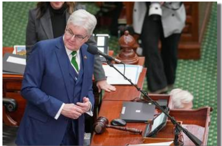
Rep. Burrows, with the help of Democrats, became the next speaker of the Texas House of Representatives.