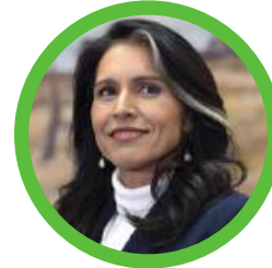
Tulsi Gabbard DNI