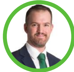
Jameson Greer USTR