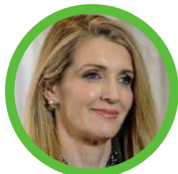
Kelly Loeffler SBA