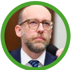
Russ Vought OMB