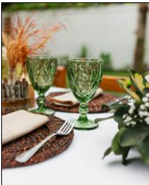
Table Decorating Contest