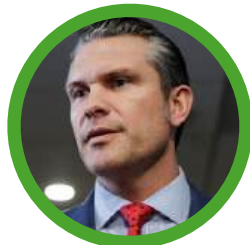
Pete Hegseth Defense