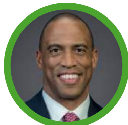
Scott Turner HUD