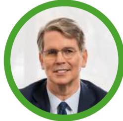
Scott Bessent Treasury