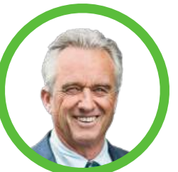
RFK, Jr. HHS