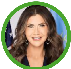
Kristi Noem DHS