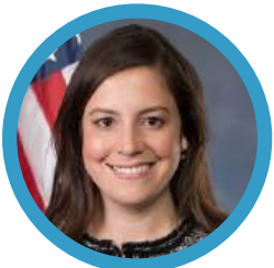
Elise Stefanik UN Ambassador