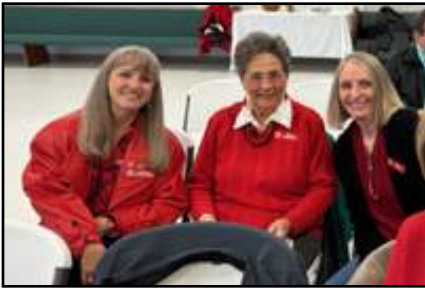
Canyon Lake Republican Women Business Meeting, February 19, 2025