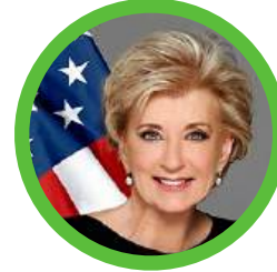
Linda McMahon Education