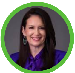
Brooke Rollins Agriculture