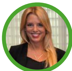
Pam Bondi Attorney General