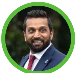
Kash Patel FBI

DeRemer is poised to be confirmed by the Senate next week as Labor Secretary. Stefanik's confirmation has been delayed because her vote is needed in the House. Remarkably, Trump's Cabinet confirmations have proceeded more quickly than even Obama's Cabinet confirmations.