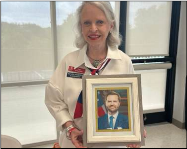
July 16 Business Meeting