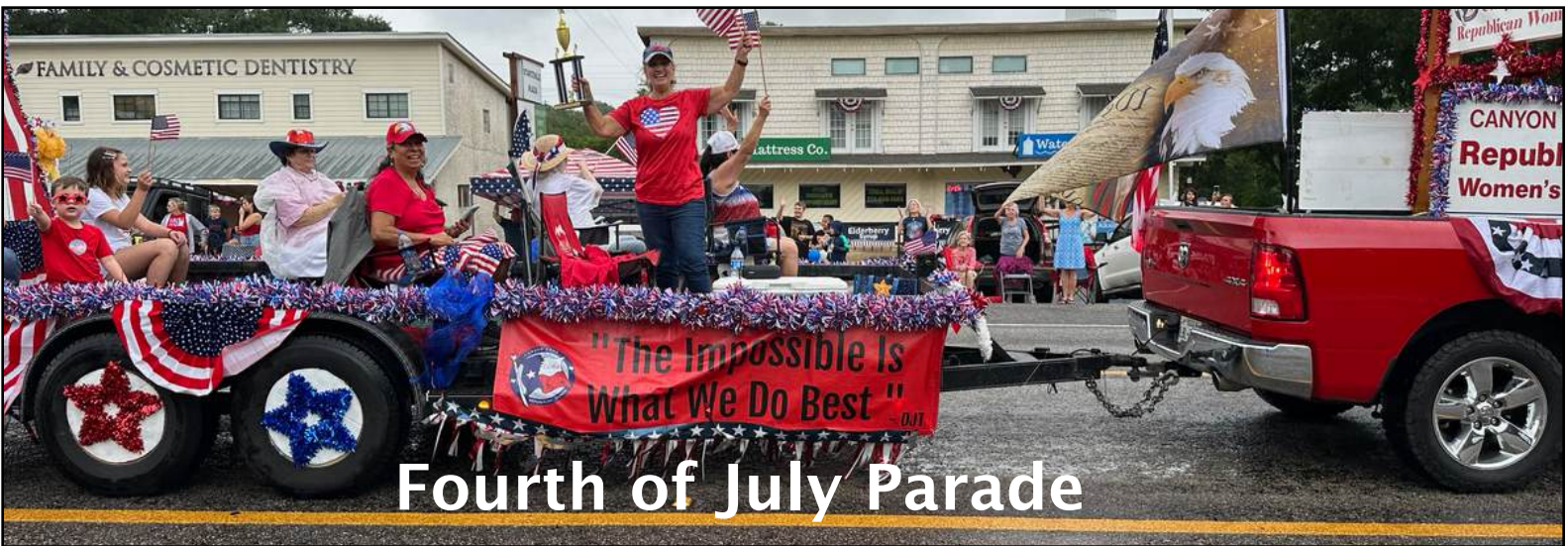
Fourth of July Parade