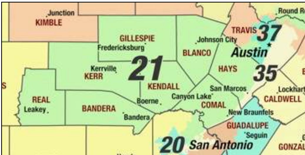
Current Congressional Districts 21 and 35

To the left is the current Comal County Congressional Districts 21 & 35. As you can see, District 35, which is represented in beige on the map, includes part of Austin, runs along the I35 corridor and includes part of San Antonio. So a tiny strip of Comal County is in District 35.