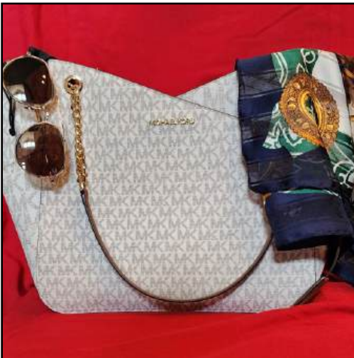
Michael Kors Handbag with Krewe Sunglasses and Western Scarf

Get ready to bid on these exciting items!