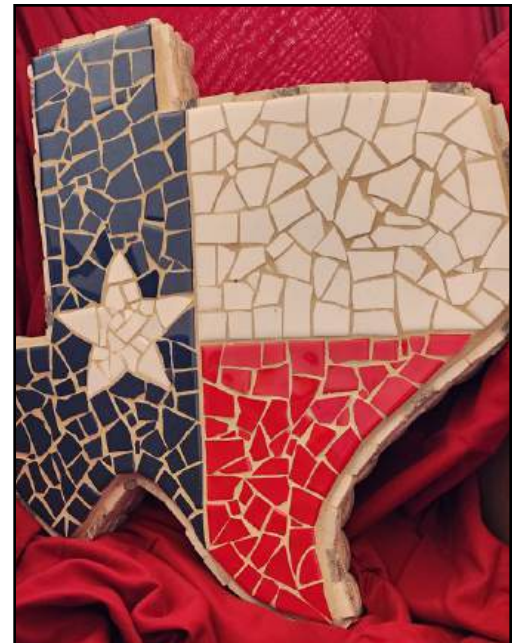
Beautiful handcrafted Texas Stepping Stone