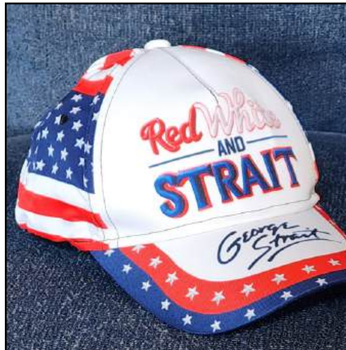
Who doesn't need a George Strait Patriotic Hat?!