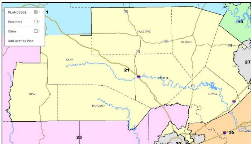
Proposed Congressional District 21

To the left is the current Comal County Congressional Districts 21 & 35. As you can see, District 35, which is represented in beige on the map, includes part of Austin, runs along the I35 corridor and includes part of San Antonio. So a tiny strip of Comal County is in District 35.