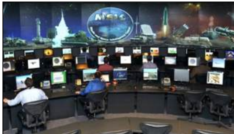
The Missile and Space Intelligence Center at Red Stone Arsenal in Huntsville, Alabama