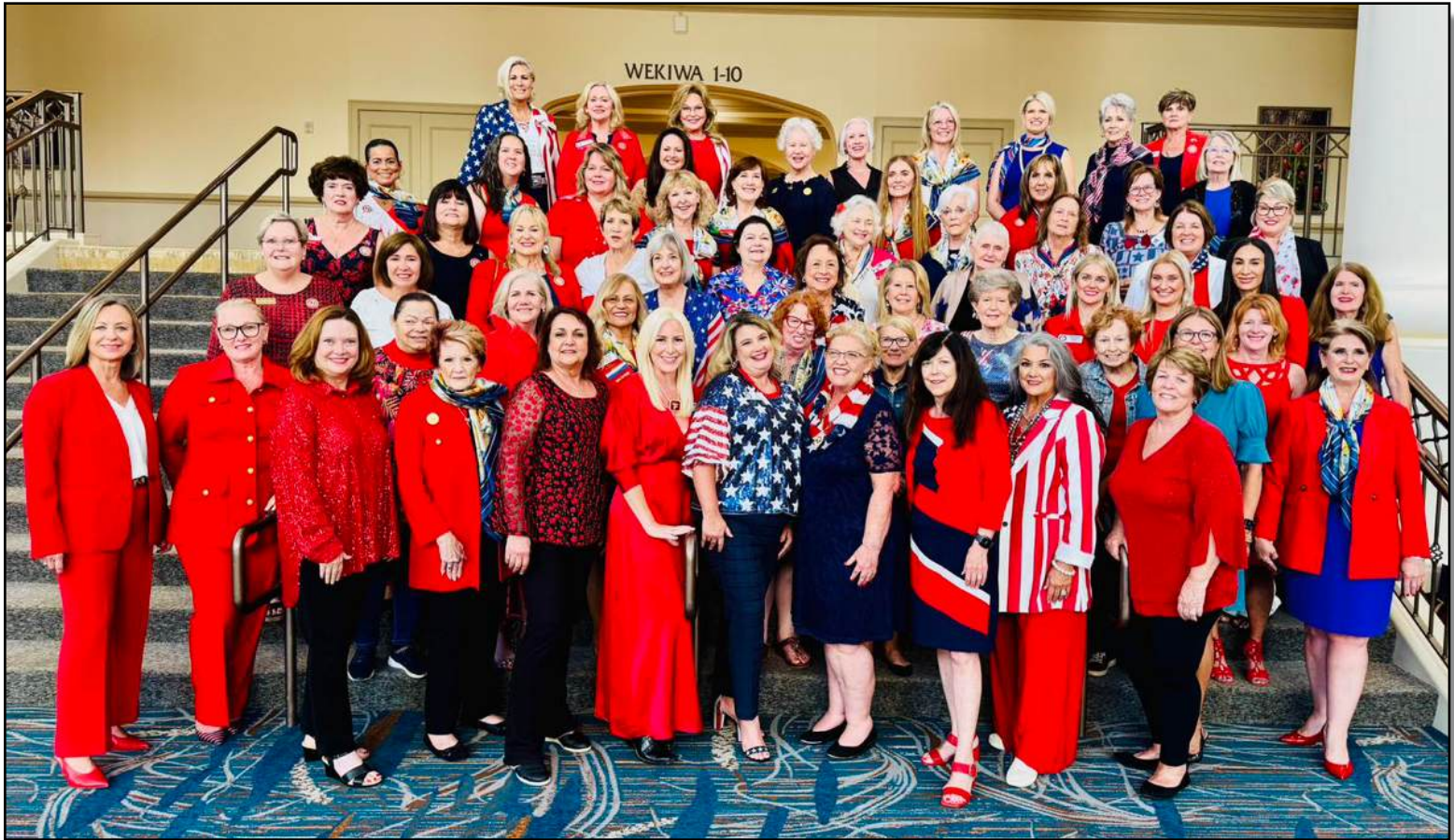
The Texas Federation of Republican Women delegates to the NFRW Convention