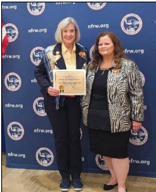
CLRW's Diamond Achievement Award