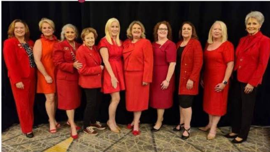
2026 TFRW Officers