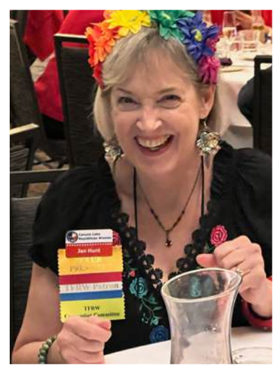
TFRW 35th Biennial Convention on October 23 - 25 in San Antonio.