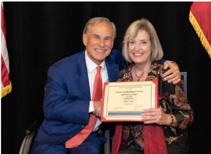
Most Political Hours for Jumbo Club Award