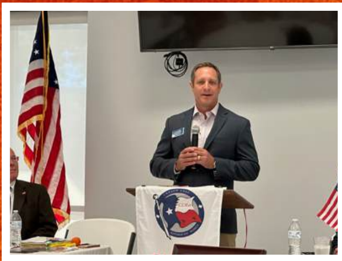
Canyon Lake Republican Women, monthly business meeting on October 15th